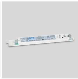
Retrofit with SMART DRIVER