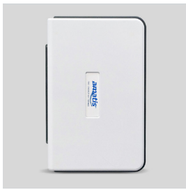
Connect with AMATIS BORDER ROUTER (AMBR)