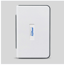
Connect with AMATIS BORDER ROUTER (AMBR)