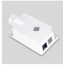
Enable smart fixtures with ADVANCED LOAD CONTROLLER