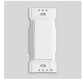
One-touch power with BATTERY OR WIRED SWITCHES