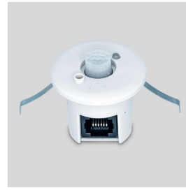
Detect MLTH with SENSORS