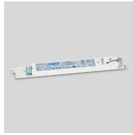
Retrofit with SMART DRIVER